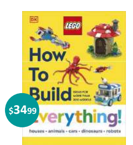
A guide to building 150 different LEGO ideas, with tips and techniques from expert LEGO builders. 356pgs Tyrs+ Hardback