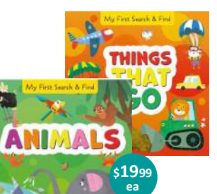
Fun search and find activity with learning! 2-5yrs Boardbook