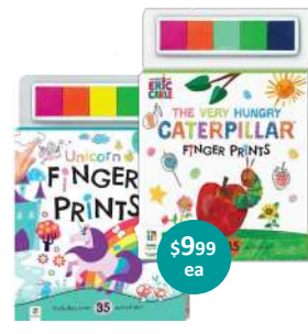
Filled with illustrations and simple text that will encourage children to use their creativity to complete the art inside. 3yrs+ Hardback

Illustrator Jessica Courtney Tickle Gorgeously illustrated retellings of a classic story, paired with 10-second sound clips of orchestras playing from the musical score. 4-7yrs Hardback 🛆 Contains batteries.