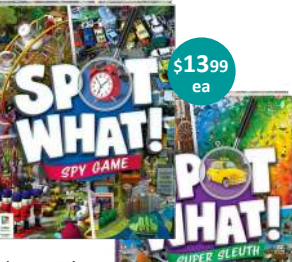
Who will be the spotting ace? Follow the clues to crack the case! Every page must be inspected for hidden pics to be detected! 64pgs 6-12yrs Hardback